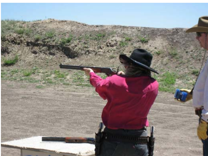
Steel Belle Celebrates Her Birthday with 1 st CAS Shoot