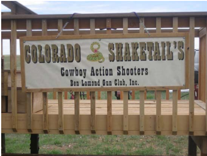
Our Banner Promoting the Shaketails and BLGC