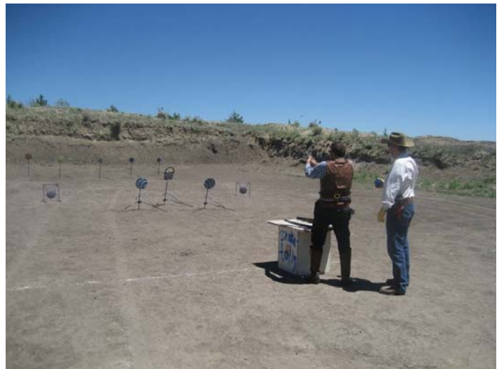
Widow Maker Returns