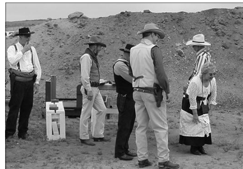
Real gents would turn away while a lady gets dressed!

stage to drop for who. Keep your fingers crossed for better weather in July!